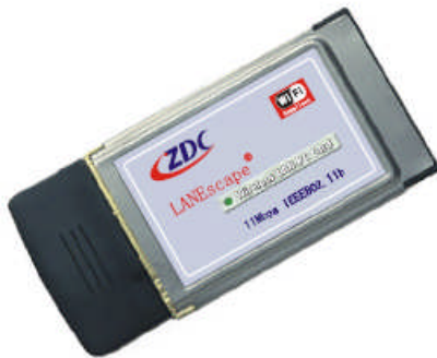
Model: XI-325HP(200mw) XI-325HP+(300mw)